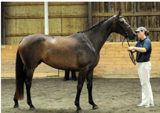
High Score Hanoverian Mare "Fontyn".