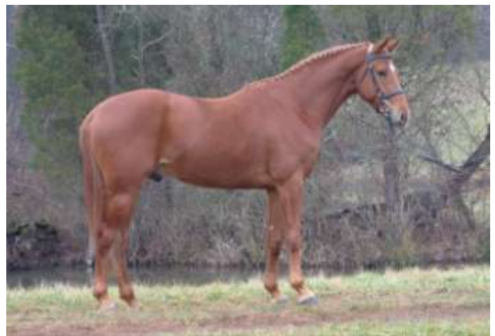
ES Liberty Gold owned by Hilton Farm.