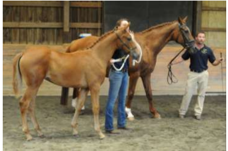
Best Filly "EM Lucy 2011" (aka Laura).

In case you're wondering, I did get to meet ES Liberty Gold. During lunch I found this wonderful stallion in his stall. Even though he was surrounded by mares and foals, ES Liberty Gold stood quietly eating hay. He is a gorgeous stallion with a super character. My expectations were definitely exceeded!