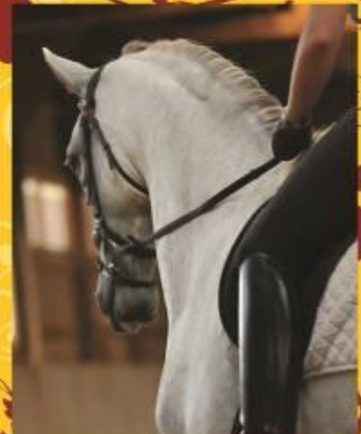
Luminoso - 2004 Grey Gelding Gaucho III x Legitima V Currently schooling at First Level