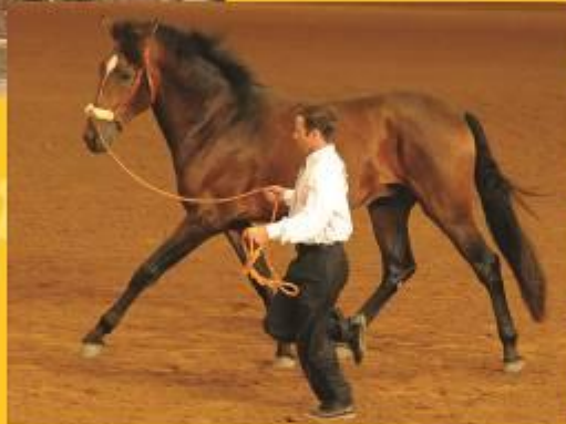
Vaquero — 2008 Bay Stallion Gaucho III x Esencia

Gold Medal Movement 2010 American Warmblood Society Gordonsville, Virginia